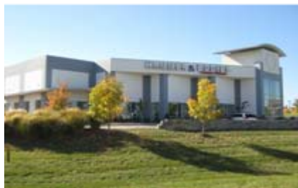
The HammerBodies Custom Fitness Clinic

Phone (800) 321-0711 or (314) 567-3797 to register!